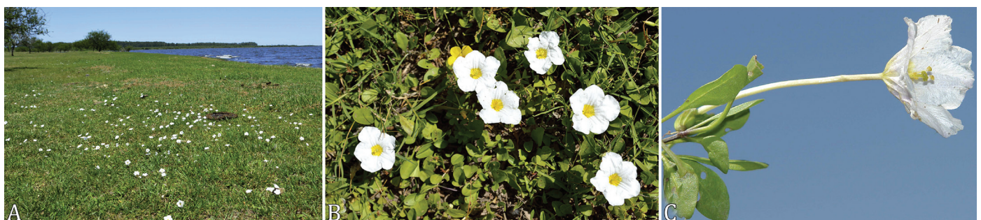
Fig.2. Location of outbreaks of enzoitic calcinosis in sheep caused by Nierembergia rivularis in Uruguay. (A) Outbreak A. The border of the Rincon del Bonete lake is invaded by the plant. (B) Natural pasture invaded by Nierembergia rivularis . (C) Details of the flowering plant.

The cadavers were emaciated and showed widespread soft tissue calcification. Muscular and elastic arteries were diffusely rigid, with marked loss of elasticity. The intimal surface was irregular with multiple white, prominent, and multifocal-to-coalescing intramural plaques (Fig.3B). The bicuspid and semilunar aortic valves exhibited similar plaques that were also identified in the tendinous and endocardial cords. The lungs did not collapse and showed multifocal calcification, mainly in the caudal lobe. The kidneys exhibited whitish, opaque, linear, and radially arranged striations in the cortical and medullary region (Fig.3C). Marked thickening of