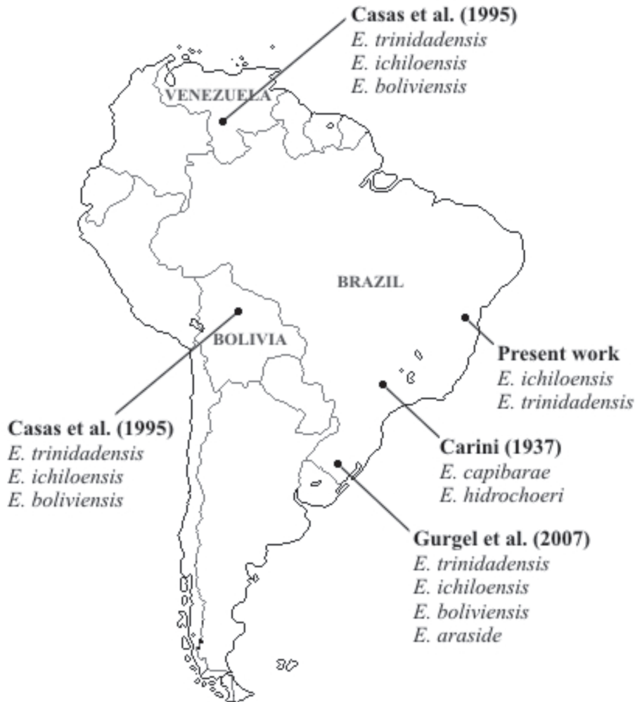
Fig.3. Map of South America, showing 5 localities where eimerid coccidia recovered from capybaras, Hydrochoerus hydrochaeris were described. In each locality references of each coccidian species previously reported are indicated.

Type Host: Hydrochoerus hydrochaeris Linnaeus, 1766 (Rodentia: Hydrochaeridae).