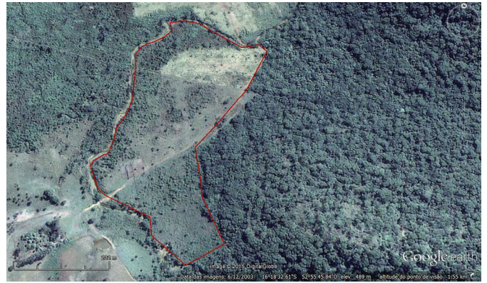
Fig.1. Independence Farm, Torixoréu, Mato Grosso, Brazil. (A) Green Niederzuehella stannea in a pasture of dry Brachiaria spp. (B) Cattle consuming leaves of N. stannea in August 2013. (C) Sprouts of N. stannea . (D) Flowers and fruits of N. stannea .

Inspection of the pastures was performed on 80 farms in the municipality of Torixoréu, Mato Grosso. The aim