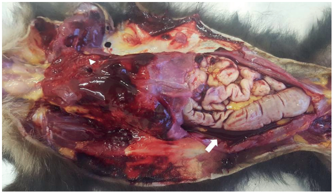
Fig.1. Severe hemorrhagic edema in the subcutaneous tissue with chest perforation (arrow head) and moderate amount of bloody fluid in peritoneal cavity (arrow) of Geoffroy's marmoset.

The small intestine was distended in jejunum and ileum with the presence of yellowish, soft and circular multifocal transmural nodules with approximately 0.5 cm in diame-