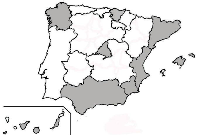
Fig.1. Map of Spain showing the location of regions where the cats were sampled.

Additional information. A questionnaire was used to collect other data regarding the cats: