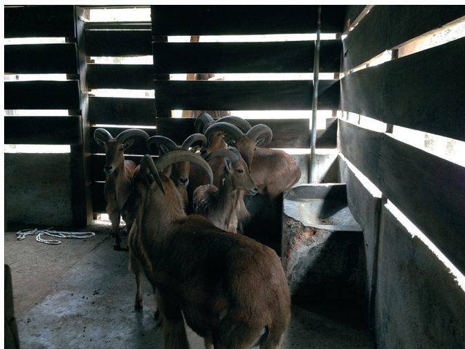
Fig.1. Group of non-visitation Barbary sheep.

Microscopic agglutination test (MAT) using a cut-off titer of 100 was performed (Faine et al. 1999). Seventeen serogroups