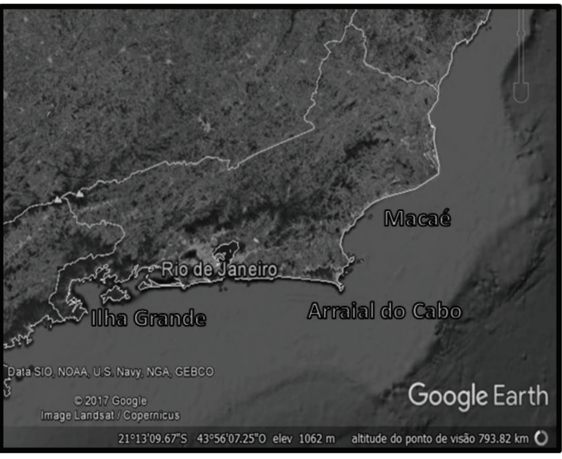
Fig.1. Map of the State of Rio de Janeiro, indicating the three regions studied.

and Enterobacteriaceae members. Additionally, the isolates were submitted to the cytochrome-oxidase test to distinguish Vibrio spp. from Enterobacteriaceae members (Koneman et al. 2008). Vibrio species identification was performed through biochemical tests based on exposure to two different concentrations ( 10\mu g and 150\mu g) of vibriostatic agent 0/129 resistance (2,4 diamine-6,7 diisopropilpteridine); production of ortho-nitrophenyl- \beta -galactoside (ONPG); production of acetoine by using the Voges-Proskauer test; fermentation of glucose, sucrose, arabinose, lactose, cellobiose, mannitol, maltose and mannose; presence of lysine and ornithine decarboxylase; presence of arginine dehydrogenase; gelatin hydrolysis; presence of halophilia in different NaCl APW concentrations (0%, 3%, 6%, 8% and 10%); motility observation, indole production; and nitrate reduction (Sewell 2002). Vibrio alginolyticus ATCC 17749 was used as reference strain.