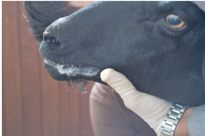
Fig.4. Experimental poisoning by cassava wastewater. Sheep 3 exhibited salivation and dilated nostrils 15 minutes after the ingestion of 0.99 \text{ mg HCN kg}^{-1} \text{ BW} .

ep 1, 2, and 3 showed severe signs including tachycardia, tachypnea, dilated pupils, drooling, dilated nostrils (Fig.4), engorged episcleral vessels, ataxia, weakness (Fig.5), muscle tremors, ruminal atony and bloat. Sheep 4 and 5, which ingested 0.63 \text{ mg HCN kg}^{-1} and 0.5 \text{ mg HCN kg}^{-1} , showed mild clinical signs that included ruminal hypomotility, dilated nostrils, tachycardia, and tachypnea. The five sheep recovered in 10-40 minutes after thiosulfate treatment. On the second day of experiment, only sheep 1 and 2 exhibited clinical signs of tachycardia and tachypnea. Sheep 1 exhibited mild muscle tremors. Sheep 1 and 2 recovered 20 and 17 minutes after application of 20% sodium thiosulfate, res-