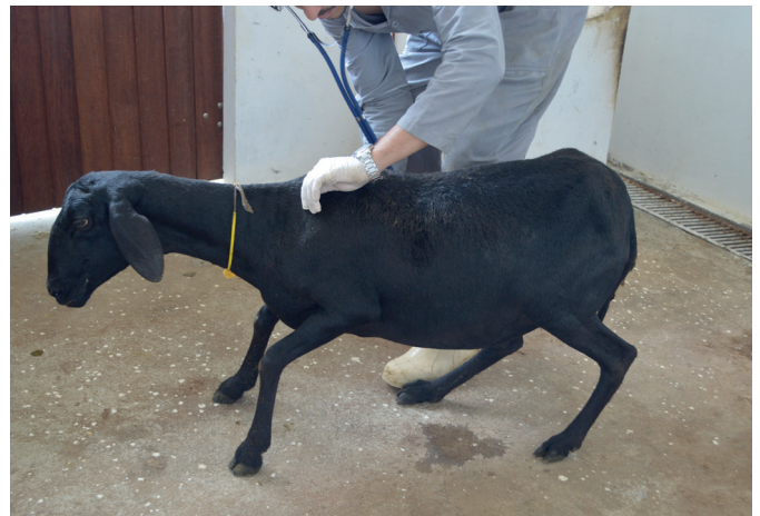
Fig.5. Experimental poisoning by cassava wastewater. Sheep 3 exhibited respiratory distress and flexion (weakness) of the four limbs, 16 minutes after the ingestion of 0.99 \text{ mg HCN kg}^{-1} \text{ BW} .

Reaction: +++ accentuated, ++ moderate, + mild, - no reaction.