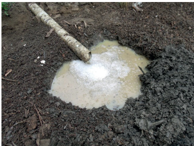
Fig.1. Cassava wastewater being discharged through a pipe to an unprotected area to which animals have access.

Manihot esculenta Crantz (cassava) is a cyanogenic plant which tuber roots are used to produce flour or starch. The processing of the tubers yield different by-products including wastewater, which is the liquid pressed out of the tuber after it has been mechanically crushed (Cereda 2001). In Brazil, cassava wastewater has been used as animal food (Almeida et al. 2009). It is also recommended as fertilizer (Ferreira et al. 2001). However, in most cases, the wastewater is disposed into the environment causing pollution or animal poisoning (Fig.1). In a recent study carried out by our research group, cassava wastewater was mentioned by 27 out of 67 farmers as the main cause of animal poisoning in the region and affected cattle, sheep, donkeys, pigs, and chicken (Pinheiro et al. 2013). Usually, poisoning occurs when the wastewater is discharged through pipes or channels to containers or areas to which animals have free access. The cassava varieties used in northeastern Brazil for flour production are the bitter varieties with roots containing 0.02-0.03% HCN (DM basis) (Murugesrawi et al. 2006). The cyanogenic glycosides contained in cassava are linamarin (approx. 95%) and lotaustralin (5%). Through processing, linamarase comes in contact with cyanogenic glycosides and catalyzes the hydrolysis to glucose and cyano-