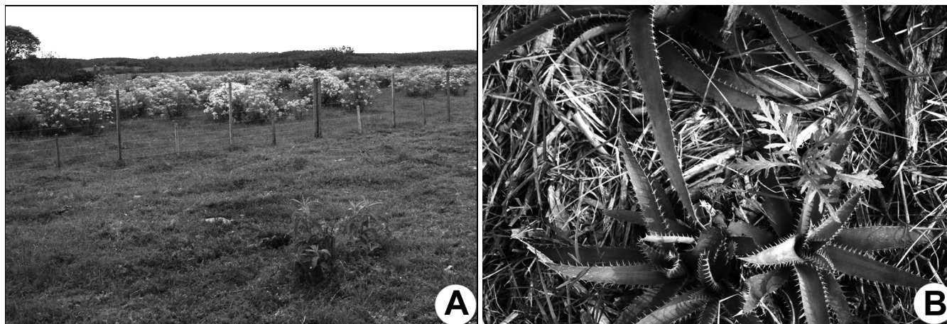
Fig.2. (A) The Senecio brasiliensis populations infesting the contiguous area adjacent to but on the other side of the fence that limits the sheep paddock. (B) Experimental paddock the Senecio brasiliensis seedlings emerging between the spiny leaves of Eryngium horridum , also named 'gravatá'.