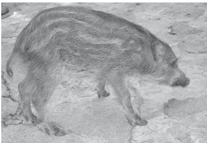
Fig.1. A 4-month-old wild boar affected by the postweaning multisystemic wasting syndrome (PMWS).

The disease occurred in two farms located in the state of Rio Grande do Sul, Brazil. Herds were composed of approximately 1,250 animals, and farmers noticed a 50-percent mortality rate from birth to slaughter, at 9-month-old. A total of 26 non-thriving 4 to 5-month-old wild boars that had been showing progressive wasting (Fig. 1) and at least one of the following signs: respiratory distress, ocular discharge, and diarrhea were euthanized and necropsied. Animals