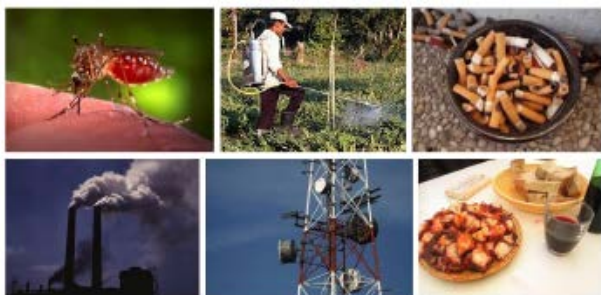
FIGURE 3 Environmental factors that influence human health. Author: Marcelo S. M. Silva

sive numbers of participants, minimizing possible experimental biases. It can be mentioned as example the association between smoking and lung cancer. 7,8 The close relation between the presence of certain environmental factors and the development of malignant tumours highlights the importance of detoxification enzymes that act to minimize potential damages to the organism. In addition to malignant neoplasia, many other pathologies have been associated to the influence of environmental factors, such as inflammatory bowel disease, respiratory diseases, food poisoning, pesticide poisoning and occupational illnesses. An example of labour disease caused by environmental factor is the green tobacco sickness, which is an acute nicotine poisoning caused by the farmers skin contact with tobacco leaves. 9 Figure 3 shows some environmental factors that affect human health.