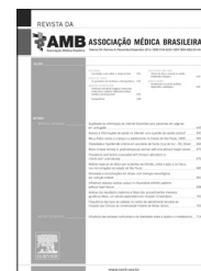
Image em medicine