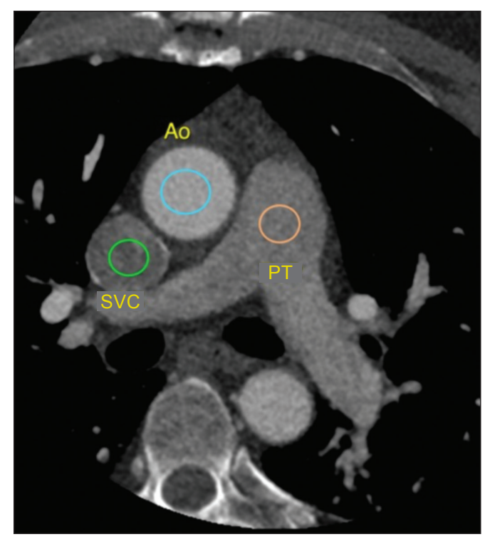
Figure 1. Attenuation monitoring sites (ROIs) within the superior vena cava (SVC), pulmonary trunk (PT), and ascending aorta (Ao).

The peripheral venous circulation time was defined as the time from the start of intravenous injection of the contrast agent (into the antecubital vein) to the detection of increased attenuation related to the arrival of the contrast agent in the ROI drawn on the distal portion of the superior vena cava. Increased attenuation was defined as a