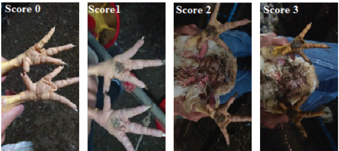
Figure 1 – The degree of the lesion in broiler footpad (0 for sound footpad, 1 for footpad with less than 50% lesion, 2 for footpad with an injury between 50 to 100%, and 3 for footpad and digits with lesions; Hashimoto et al. , 2011).

Footpad lesion was scored using the scale of Hashimoto et al. (2011) (Figure 1), where 0 = no lesions, 1 = lesion in 50% of the footpad area, 2 = lesion in 50-100% of the footpad area, and 3 = lesion in 100% of the footpad area and in surrounding areas.