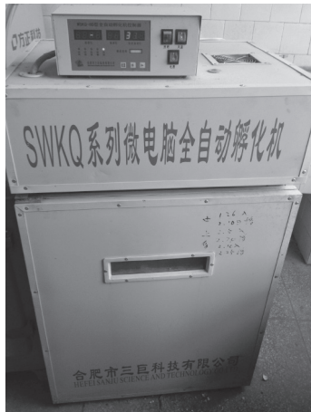
Figure 1 – SWKQ series microcomputer automatic incubator

Eggs were set in an incubator (SWKQ-8D, Three Giant Technology Co., Ltd. Hefei, China) with full automatic control of a microcomputer was utilized for the constant temperature incubation (Figure 1). The egg surface was sprayed with potassium permanganate solution (1g KMnO 4 : 500ml H 2 O) for disinfection.