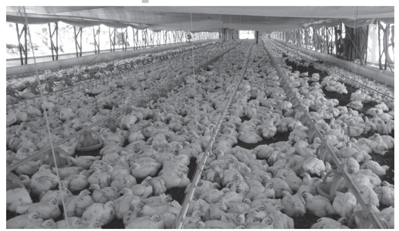
Figure 1 – Internal view of a broiler chicken farm in the State of Rio Grande do Sul, Southern Brazil, assessed using the Welfare Quality® protocol.