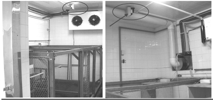
Figure 2 - View of the video camera placed in the geometrical center of the environmental chamber and the pens.

Recording of behavior: All behaviors described in Table 2 were continuously recorded by polychromatic video cameras installed on the upper part of the environmental chamber facing downwards, and on the upper part of the nests (Figure 2).