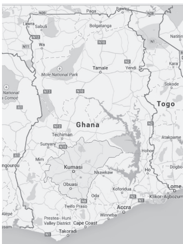
Figure 1a: Map of Ghana

Multistage sampling was carried out using stratified random sampling. The three regions where poultry populations are high in Ghana were listed. They are Brong Ahafo, Ashanti, and Greater