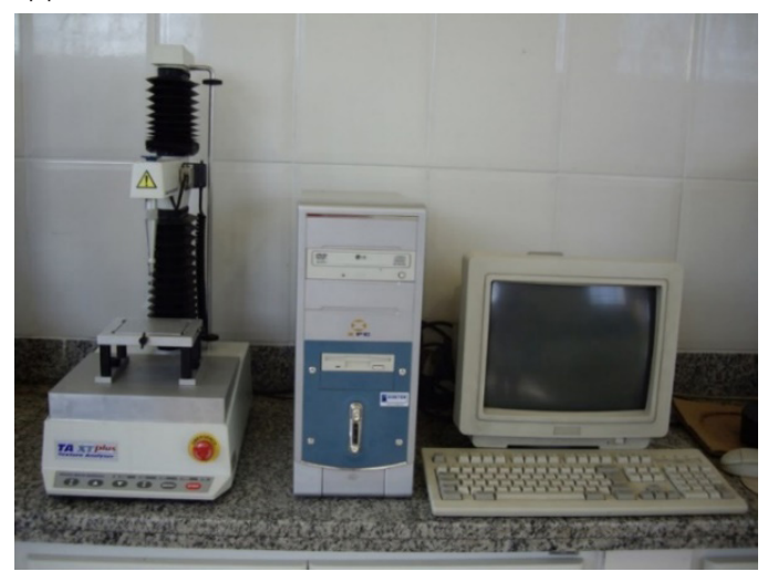
Figure 1 – Texturometer TA. XT Plus of the FMVZ Egg Analysis Laboratory.

Analyzer TA.XT Plus, Stable Micro Systems, UK) were tested (Figures1 and 2). Eggs were placed on the flat platform of the equipment always in the same position in order to ensure the standardization of the procedure. A pre-test velocity of 2.0 mm/s, test speed of 1.0 mm/s, and post-test velocity of 4.0 mm/s were applied.