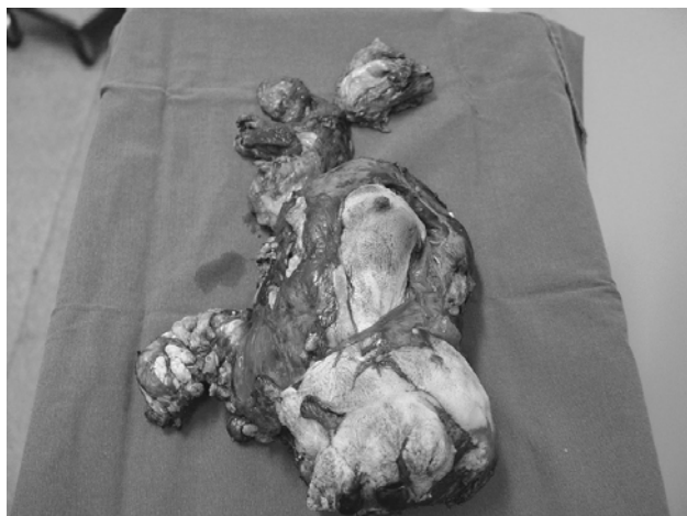
Fig. 3 – Final aspect of the mass after surgical resection