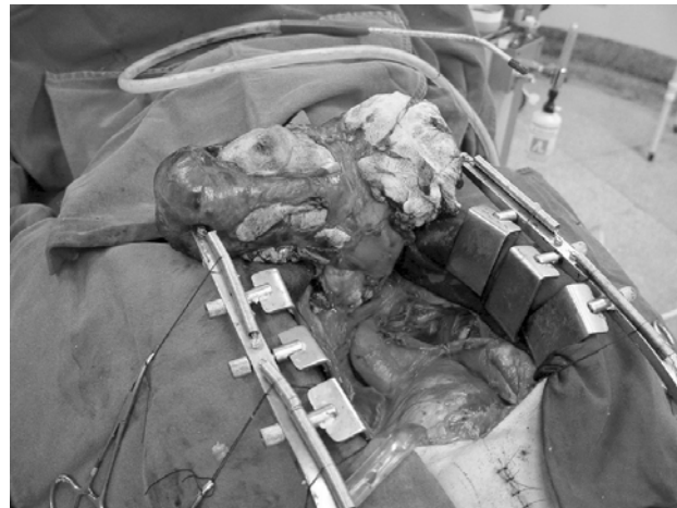
Fig. 2 – Intra-operative image of the anterior mediastinum tumor