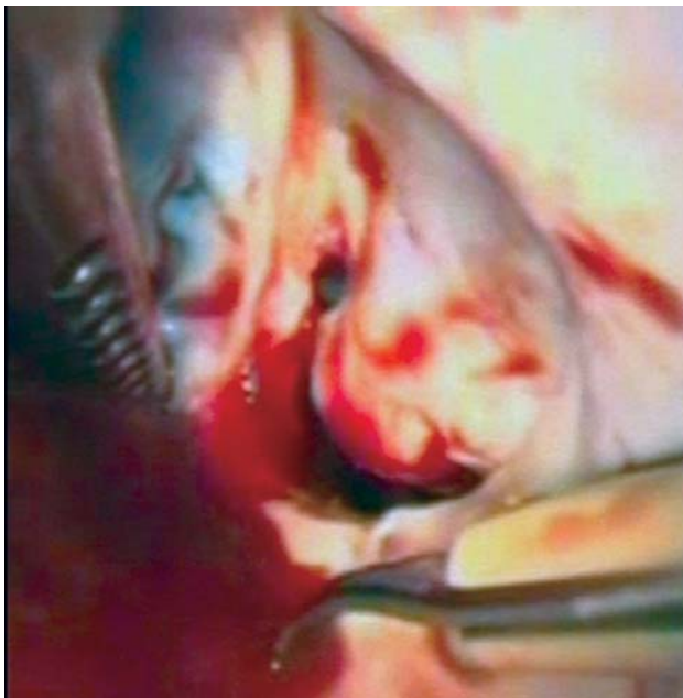
Fig. 3 – Preoperative view of the mitral valve, showing critical stenosis

The echocardiography control showed correction of mitral stenosis, with an area estimated at 2.2 cm 2 without transvalvar gradient and slight insufficiency, decrease of the SPAP to normal values (55 to 20 mmHg). The patient was asymptomatic during the 24 months of follow-up, and was pregnant during this period.