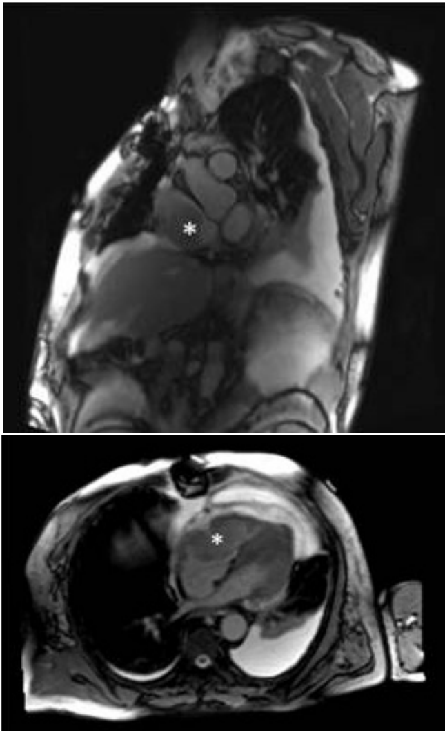
Fig. 3 – Magnetic resonance imaging showing recurred mass in the right atrium.