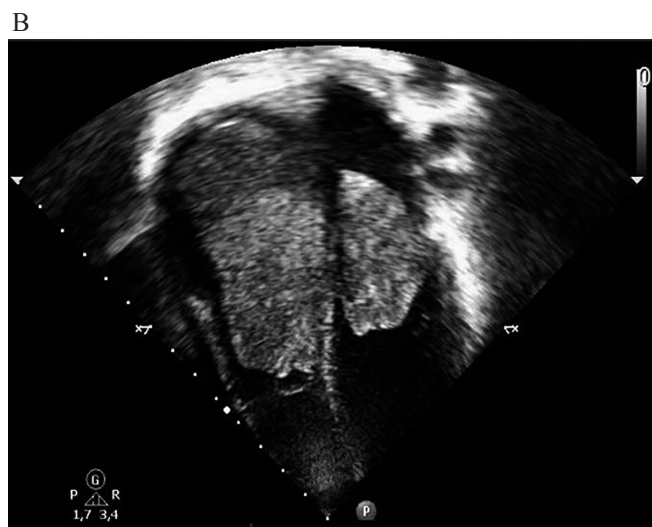
Fig. 1 - A. Two-dimensional echocardiogram preoperatively showing the masses within the atria. The largest mass is located in the right atrium and occupies all of its cavity. It measures 2.75 x 1.57 inches in its greatest diameter. The mass in the left atrium measuring 1.77 x 1.18 inches; B. Invagination of the masses to the ventricles interior during diastole.