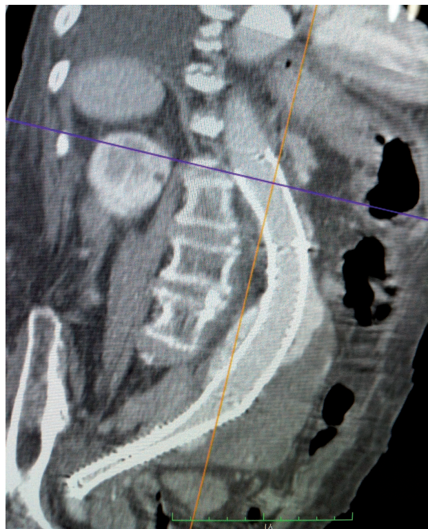
Fig. 2 - Post-stent implantation in triple layer except for abdominal aortic aneurysm and right common iliac

During angiographic control, predominately central laminar flow was observed with filling predominantly of right iliac arteries and the presence of peri-stent flow with