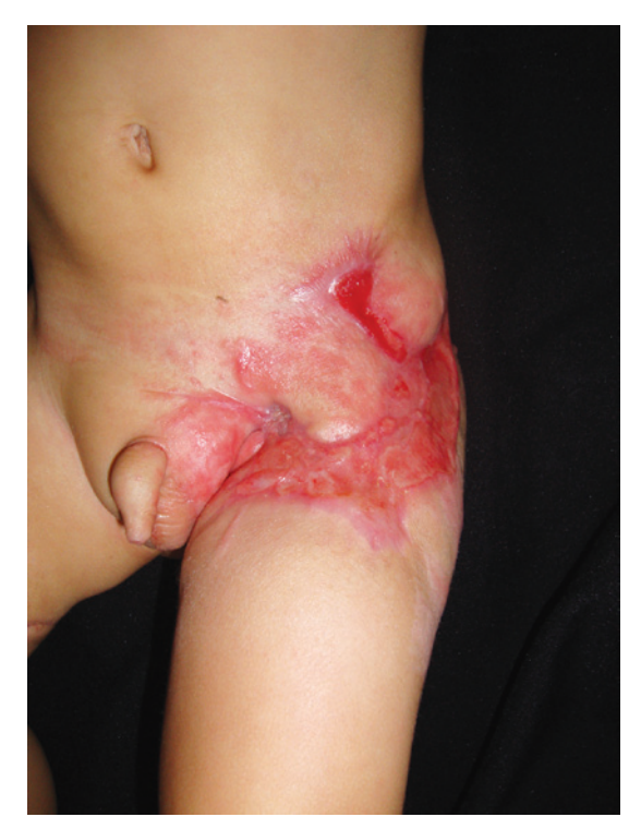
Figure 4 – Three-month postoperative appearance after grafting partial skin and use of Limberg flap to protect the femoral vessels.