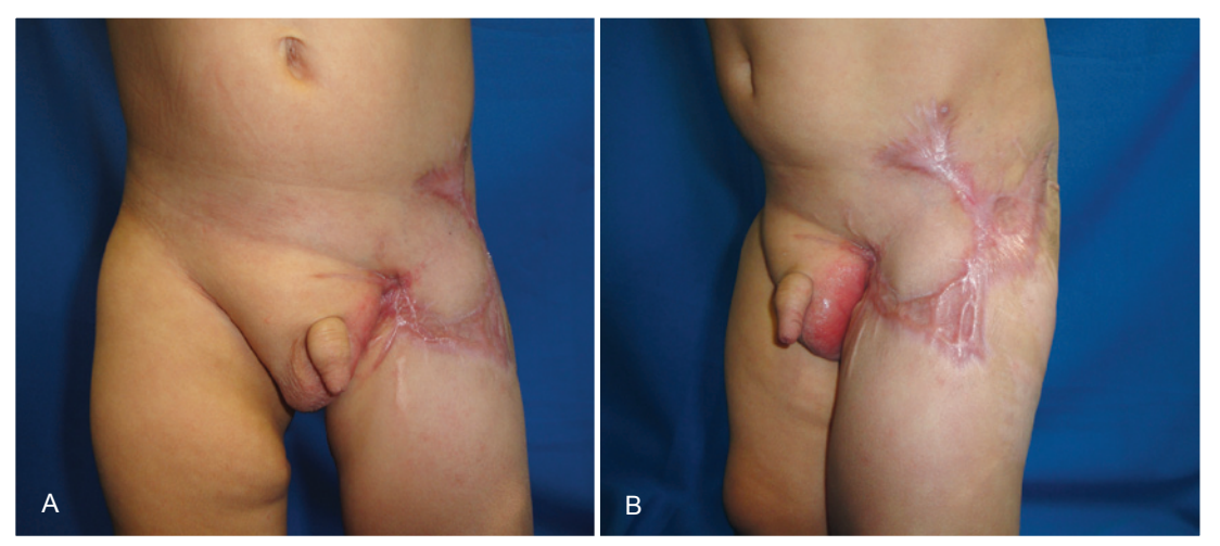
Figure 5 – Six-month postoperative appearance. In A, frontal view. In B, oblique view.