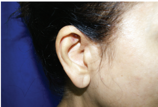
Figure 1 – Appearance ear lobe with atrophy and sagging, showing earring hole with vertical aspect.