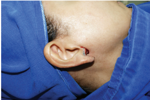
Figure 4 – Intraoperative aspect of wedge resection on overall plan of the excess of the lobe.