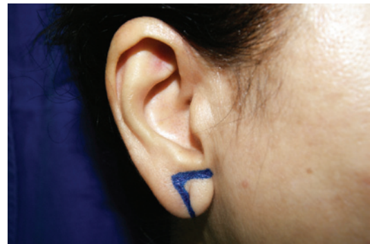
Figure 3 – Preoperative marking of the skin excess in earlobe.