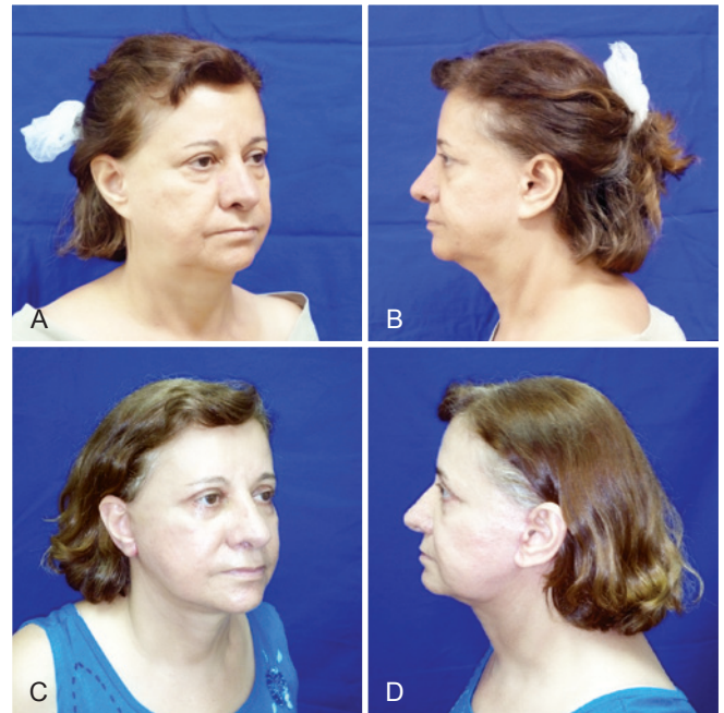
Figure 7 – In A and B , preoperative appearance of secondary rhytidectomy associated with rejuvenation of the earlobe, pulled aspect of the lobe, respectively, in right oblique position and left profile. In C and D , 30 days postoperative appearance of secondary rhytidectomy and rejuvenation of the lobe, showing little apparent auricular scar, respectively, in right oblique position and left profile.

McKinney et al. 6 , in 1993, specifically addressed the treatment of ear in rhytidectomy and found no significant correlation between the height of the earlobe and aging. No difference in the size of the lobe between men and women was reported. Although the total size of the ear is greater in men, the height and width of the earlobe remain almost identical to women. This suggests that increasing the height of the ear with age is not entirely due to the effect of weight of earrings. Stretching the earlobe is most probably an inevitable result of aging.