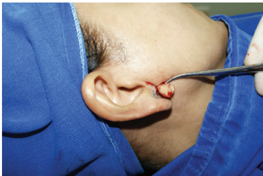
Figure 5 – View the resected specimen.

scars. The restoration of the shape, size and contour of the lobe of the ear translates the joviality, and consequently the face with aesthetic benefit and patient satisfaction.