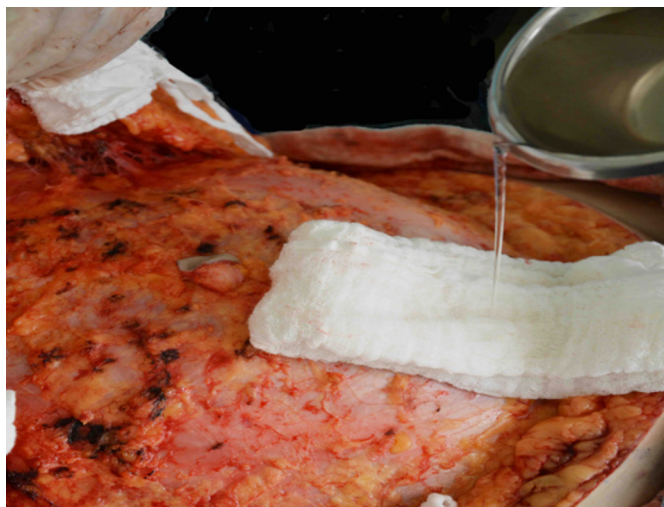
Figure 1. Washing with saline solution.

abdominis are followed by washing with 1 liter of 0.9% saline solution, using dressings to mechanically debride the surface of the flap and abdominal wall fat tissue (Figures 1 and 2).