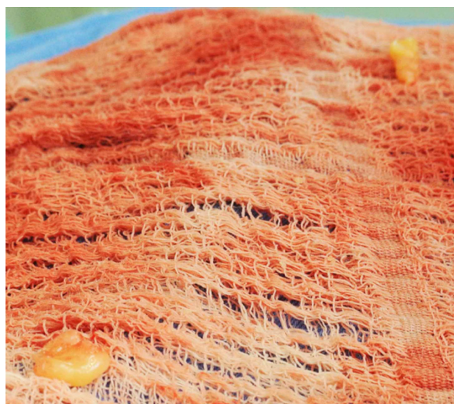
Figure 4. Devitalized fat tissue that is removed by friction using dressing.

authors. In the immediate postoperative period and up to 1 month after surgery, use of a body shaper was recommended.