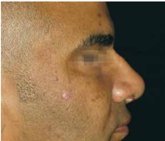
Figure 8 – Case 3. Postoperative period: lateral view.