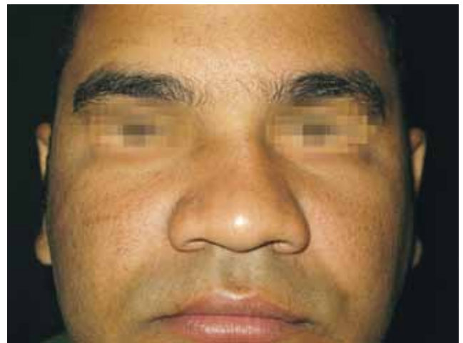
Figure 15 – Case 3. Preoperative period: frontal view.