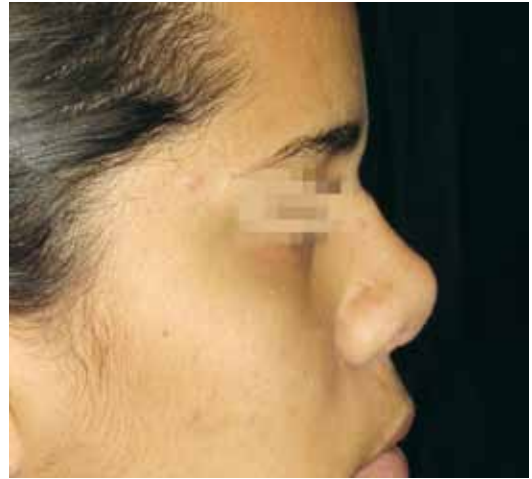
Figure 10 – Case 4. Postoperative period: lateral view.