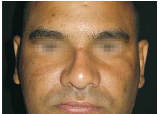
Figure 16 – Case 3. Postoperative period: frontal view.