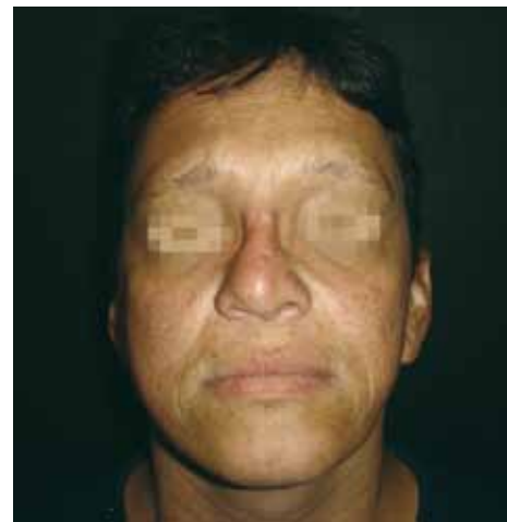
Figure 12 – Case 1. Postoperative period: frontal view.