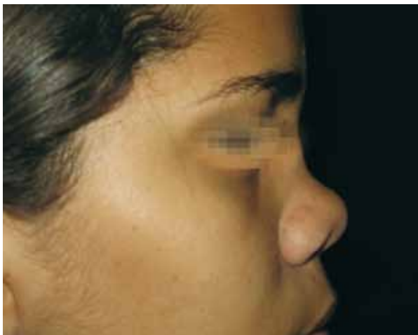
Figure 9 – Case 4. Preoperative period: lateral view.