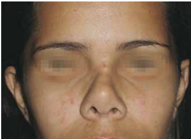
Figure 18 – Case 4. Postoperative period: frontal view.