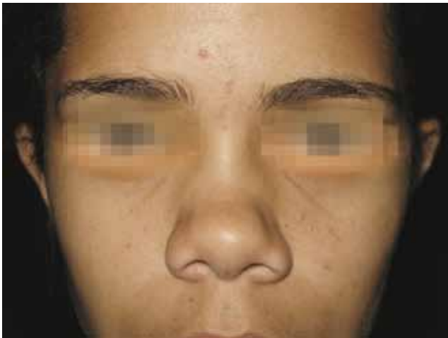
Figure 17 – Case 4. Preoperative period: frontal view.