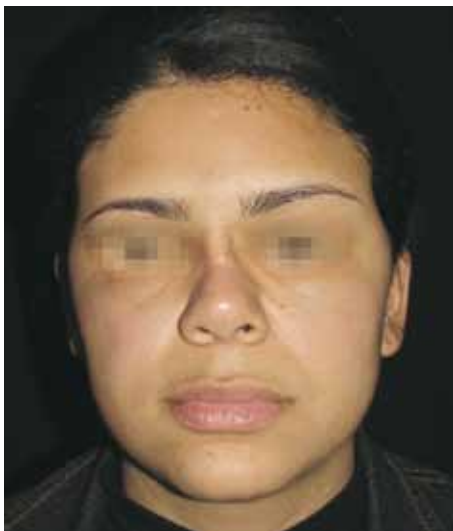
Figure 14 – Case 2. Postoperative period: frontal view.