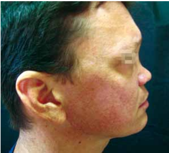
Figure 3 – Case 1. Preoperative period: lateral view.

Use of alloplastic implants is a more practical alternative because the morbidity inherent to procurement of autogenous material and manipulation of allogeneic tissue is avoided. However, alloplastic implants are