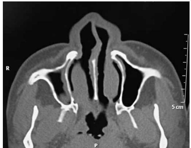
Figure 1 – Computed tomography of case 1, demonstrating the absence of septal cartilage and consequent collapse of the nasal dorsum.

All patients had the same requirement of large graft amounts for correct nose remodeling, and costal cartilage