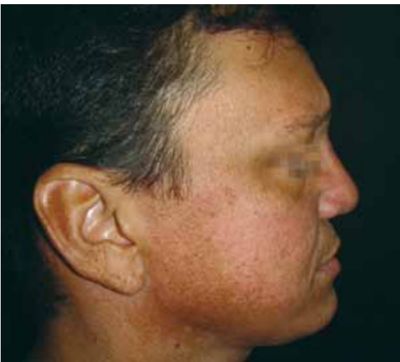
Figure 4 – Case 1. Postoperative period: lateral view.