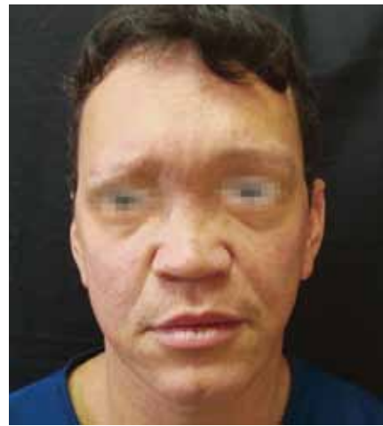
Figure 11 – Case 1. Preoperative period: frontal view.