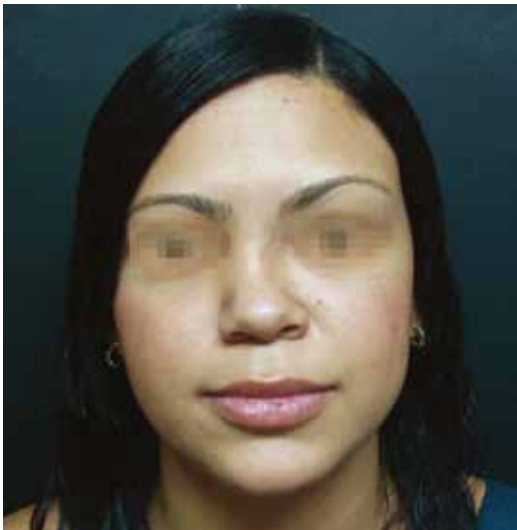
Figure 13 – Case 2. Preoperative period: frontal view.

The septal cartilage is usually the best option because it is easily carved and is obtained at the same surgical site of rhinoplasty. It has good physical strength and low rates of resorption, infection, and deformity. However, its use is limited in cases where the septum has significant deviations or when a large amount of cartilage grafting is required 7 .