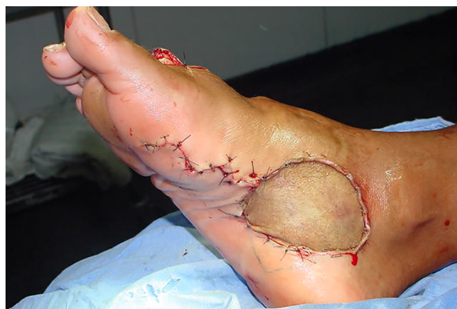
Figure 5. Fixation of the total skin graft on the donor area of the flap.