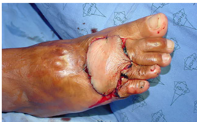
Figure 4. Flap interposed and fixed on the dorsum of the foot.

This type of flap is indicated for the reconstruction of distal defects of the plantar region in the metatarsal heads.