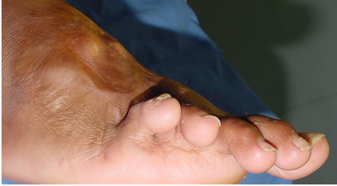
Figure 8. Late postoperative aspect of the flap on the dorsum of the foot.

posterior tibial artery to the lateral and medial plantar arteries, which allowed to almost doubling the length of the pedicle and the arc of rotation to cover the defects of the plantar and dorsal regions of the foot.