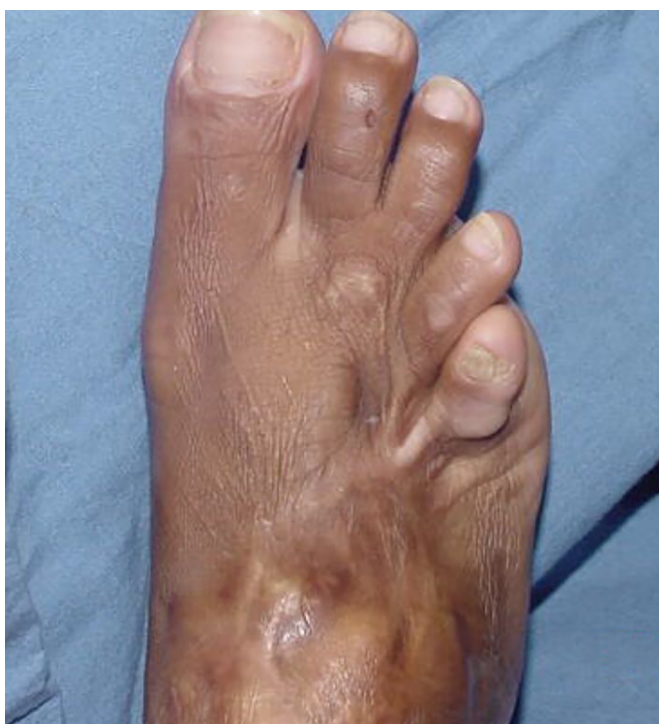
Figure 7. Late postoperative aspect of the flap on the dorsum of the foot.

Oberlin et al. 9 described the extension of the pedicle with the ligature immediately after the bifurcation of the