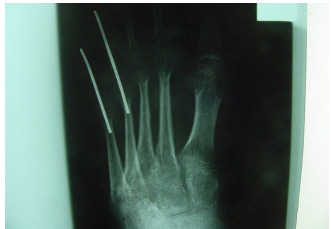
Figure 2. Fracture of the fourth and fifth metatarsals treated with fixation.

Moreover, the initial treatment of these wounds begins with clinical treatment in a sequence of surgical debridements, and the wound is better in appearance if the surgical process includes coverage with grafts, local flap or free flaps.