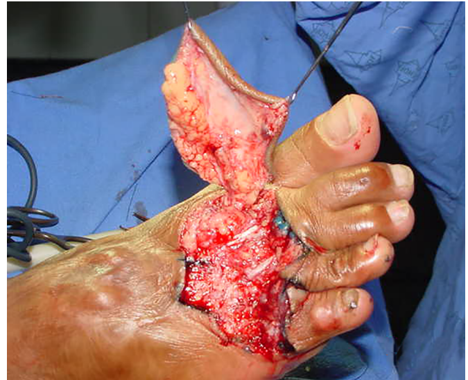
Figure 1. Defect of the dorsum of the foot from the first to the fifth metatarsals and transposition of the flap pedicle from the distal plantar flow to the dorsum through the first intermetatarsal space.

Warts on the back of the feet are caused by trauma and infections or as a result of chronic vasculopathies due to smoking and systemic diseases, such as diabetes or hypertension 3-5 .