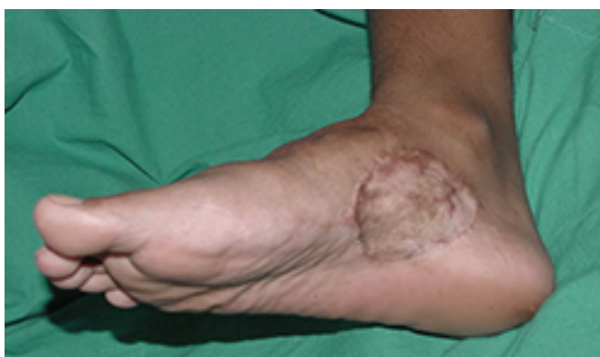
Figure 6. Late postoperative aspect of the donor area of the flap with graft.