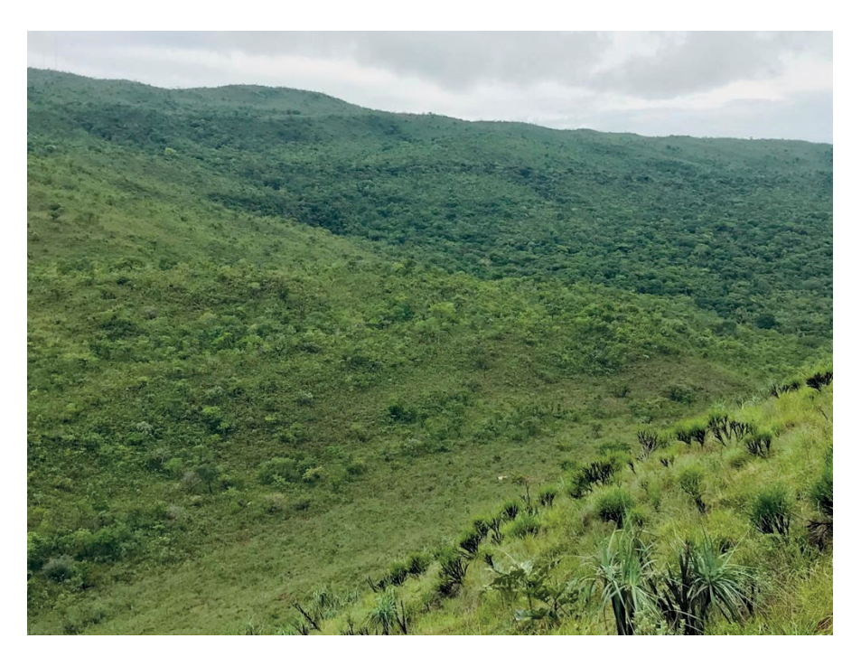
Figure 2. Ultramafic soil landscape in Niquelândia, Brazil, shows the characteristically sparse and stunted vegetation compared to the vegetation of the non-ultramafic soil in the background.

Ultramafic bedrocks and the soils developed from them have high concentrations of magnesium (Mg), iron (Fe), chromium (Cr), manganese (Mn), nickel (Ni), and cobalt (Co). Ultramafic outcrops occur in all continents and are estimated to cover roughly 3 % of the Earth's surface (Guillot and Hatori, 2013), with significant massifs in temperate (Southern Europe, Turkey and California) and tropical settings (Cuba, New Caledonia, Brazil, The Philippines, Malaysia, Indonesia and Oman), and small and occasional patches worldwide (Galey et al., 2017; Echevarria, 2018; Kierczak et al., 2021). Besides the high concentration of geogenic metals, especially the triad Cr-Ni-Co that can be toxic to plants, ultramafic soils pose a hostile environment for plant growth due to their scarcity of macronutrients such as nitrogen (N), phosphorus (P), potassium (K), or calcium (Ca) and micronutrients such as boron (B) or molybdenum (Mo), and low Ca-to-Mg molar ratios (Nkrumah et al., 2016; Nascimento et al., 2020). Therefore, the vegetation covering ultramafic soils is generally less massive and stunted than the vegetative cover of non-ultramafic soils (Figure 2).