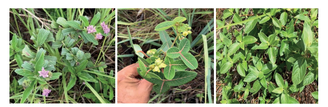
Figure 4. Nickel hyperaccumulators growing on ultramafic soil in Niquelândia - GO, Brazil. From left to right: Lippia lupulina, Manihot sparsifolia, and Justicia lanstyakii.