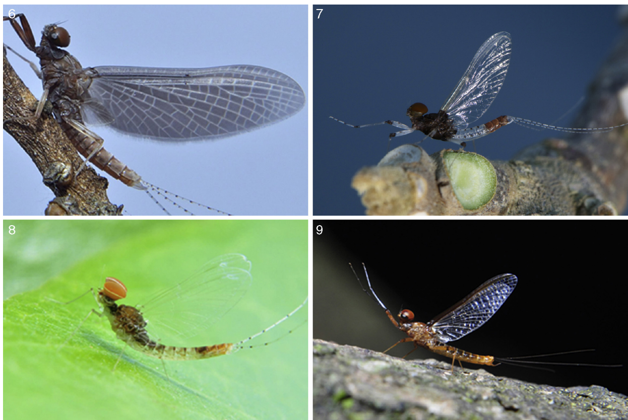
Figs. 6–9. Adults of Ephemeroptera. 6. Ulmeritoides sp. 7. Traverella insolita . 8. Aturbina beatrixae . 9. Hydrosmilodon plagatus .

Material examined: PT01: (4) 20–21/xi/2012; PT02: (1) 22–23/xi/2012; PT03: (4) 20–21/xi/2012; PT04: (1) 18–19/iv/2012; PT04: (215) 21–22/xi/2012; PT05: (155) 21–22/xi/2012.