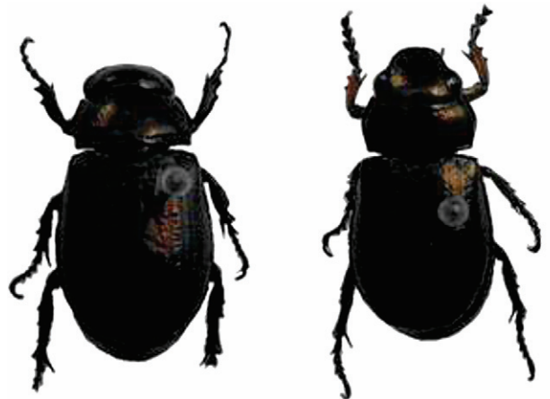
Fig. 3. Adults of Leucothyreus ambrosius : female (left) and male (right). Scale = 1 cm.

Adults of L. ambrosius can be sexed based on the tarsomers of the first pair of legs, which in males are wider, thus male individuals can be easily identified (Fig. 3). The duration of the egg to adult period of L. ambrosius is 173.3 days (Table I; Fig. 2).