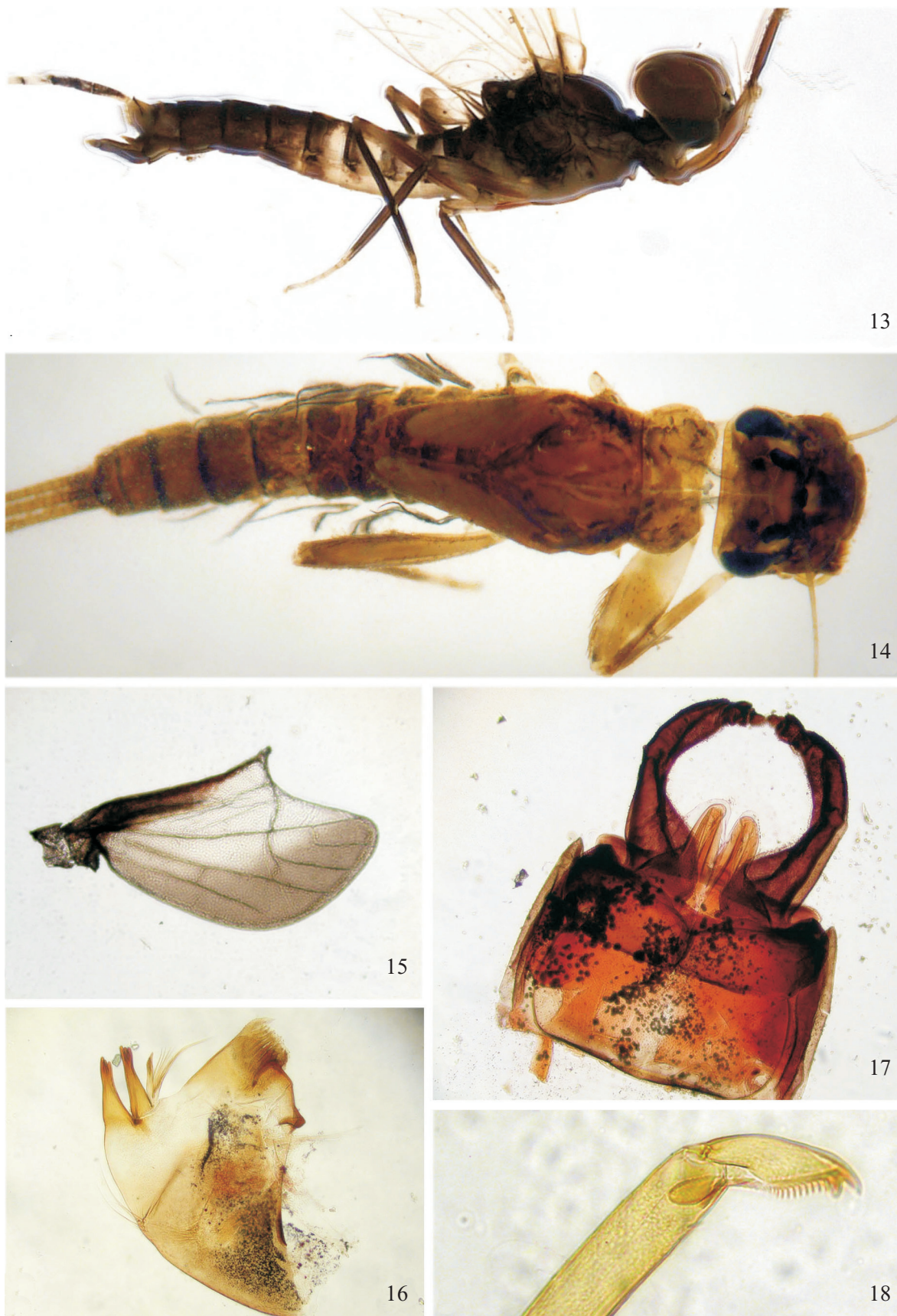
Figs. 13–18. Simothraulopsis (Maculognathus) sabalo Kluge, 2007. 13, male imago l.v.; 14, nymph d.v.; 15, hind wing; 16, left mandible; 17, genitalia v.v.; 18, tarsal claw I (d.v. dorsal view; v.l. lateral view; v.v. ventral view).