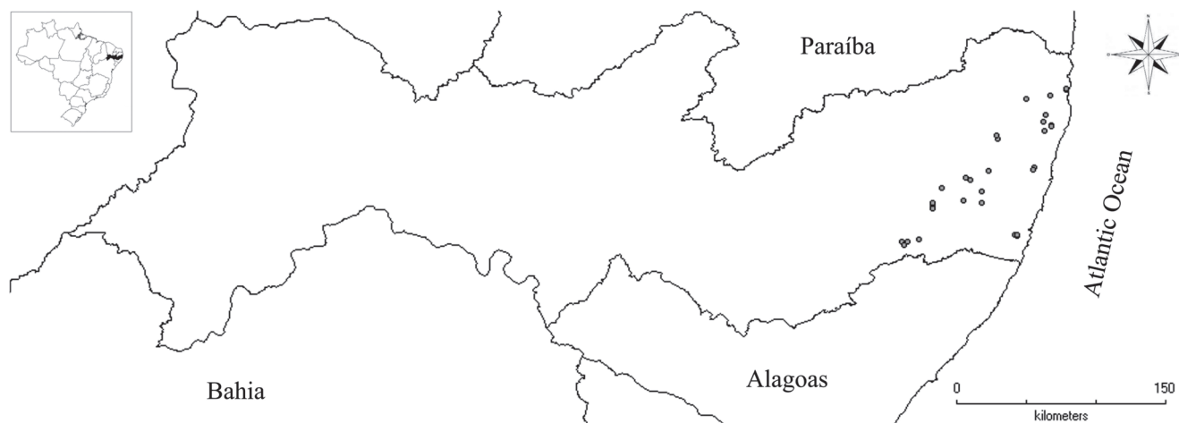
Fig. 1. Study area showing the map of Pernambuco State with the respective collecting localities.

Records of Brazilian states follow official state abbreviations. The material is deposited in the following institutions: Coleção Zoológica Norte Capixaba (CZNC) and Coleção Entomológica da Universidade Federal de Pernambuco (UFPE).