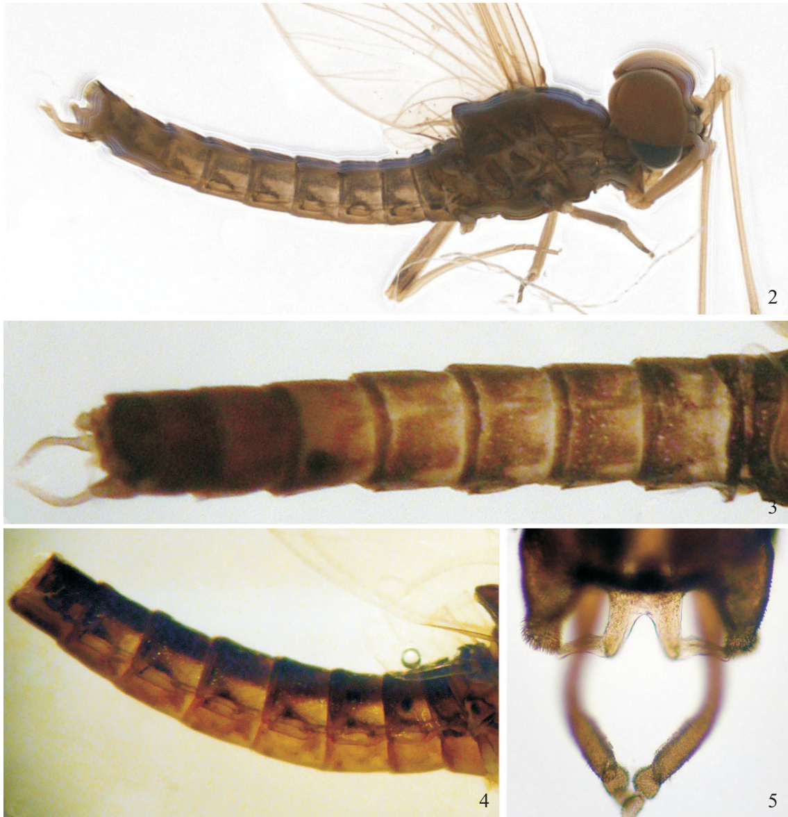
Figs. 2–5. Farrodes tepui Domínguez, Molineri & Peters, 1996. 2, male imago l.v.; 3, abdomen d.v.; 4, abdomen l.v.; 5, Genitalia v.v. (d.v. dorsal view; l.v. lateral view; v.v. ventral view).

Material. PERNAMBUCO: São Benedito do Sul, (Cachoeira Poço do Caboclo, 8°45'53.4"S 35°55'16.1"W, 532m), 3 nymphs, 28.VIII.2010, L.R.C. Lima col. (UFPE); same as preceding except 1 nymph, 26.II.2011, L.R.C. Lima, F.F. Salles cols. (UFPE); São Benedito do Sul, (Cachoeira Poço do Soldado, 8°45'52.9"S 35°53'06.1"W, 321m), 2 nymphs, 4 ♂ (light trap), 12.XII.2009, LRC Lima col. (CZNC).