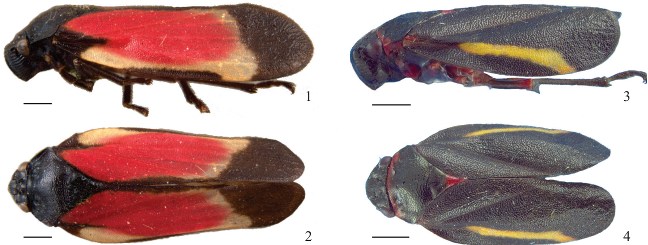
Figs. 1–4. 1–2. Sphenorhina pseudoboliviana sp. nov. 1. Paratype (MCTP-29444), lateral view. 2. Paratype (MCTP-29444), dorsal view. 3–4. Sphenorhina plata sp. nov. 3. Paratype (DZUP-male), lateral view. 4. Paratype, dorsal view (DZUP-male). Bars = 1 mm.