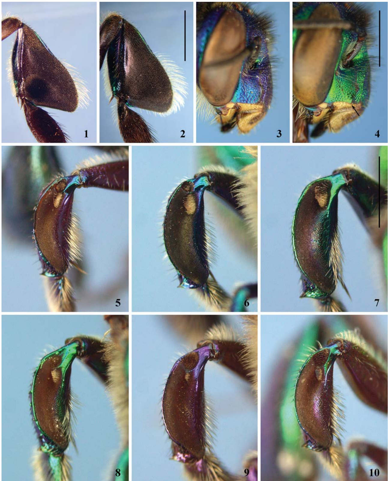
Figs. 1–10. 1, Inner surface of hind tibia of male of E. stelfeldi (from Cananéia, São Paulo). 2, Same, E. annectans (from Florianópolis, Santa Catarina). Left scale bar (= 2.0 mm) applies to Figs. 1 and 2. 3, Head, in lateral view, showing detail of epistomal suture of female of E. stelfeldi (from Alexandra, Paraná). 4, Same, E. imperialis ; arrow pointing to acute angle formed by the epistomal suture (from Conceição da Barra, Espírito Santo). Right scale bar (= 2.0 mm) applies to Figs. 3 and 4. 5–10. Outer surface of male midtibia, showing the hair tufts of the velvety area; scale bar (= 1.5 mm) on Fig. 7 applies to all figures. 5, E. stelfeldi (from Cananéia, São Paulo). 6, E. annectans (from Florianópolis, Santa Catarina). 7, E. imperialis (from Conceição da Barra, Espírito Santo). 8, E. ignita (from Conceição da Barra, Espírito Santo). 9, E. iopocila (from Alexandra, Paraná). 10, E. chalybeata (from Belém, Pará).