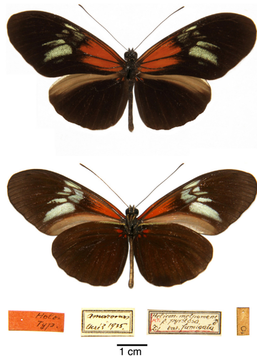
Fig. 1. Male individual (with labels) described under the name Heliconius melpomene f. pyritosa var. fumigata Zikán, 1937.