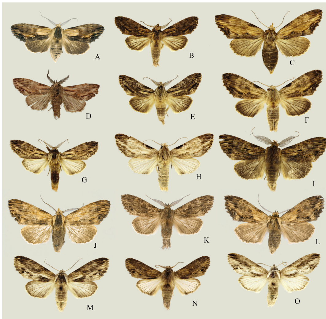
Figure 2 Xylodonta (A-L) and Nycterotis (M-O) adults, dorsal view. A. xylinata : female (Ecuador); B-D. pythia : male (Costa Rica), female (Mexico), lectotype male (Mexico); E, F. scottmilleri : male, female (Brazil); G, H. giffordi : holotype male, paratype female (Brazil); I, J. mocosa : male, female (Ecuador); K, L. monzoni : male holotype, female paratype (Guatemala); M-O. russula : female, male, female (Brazil).