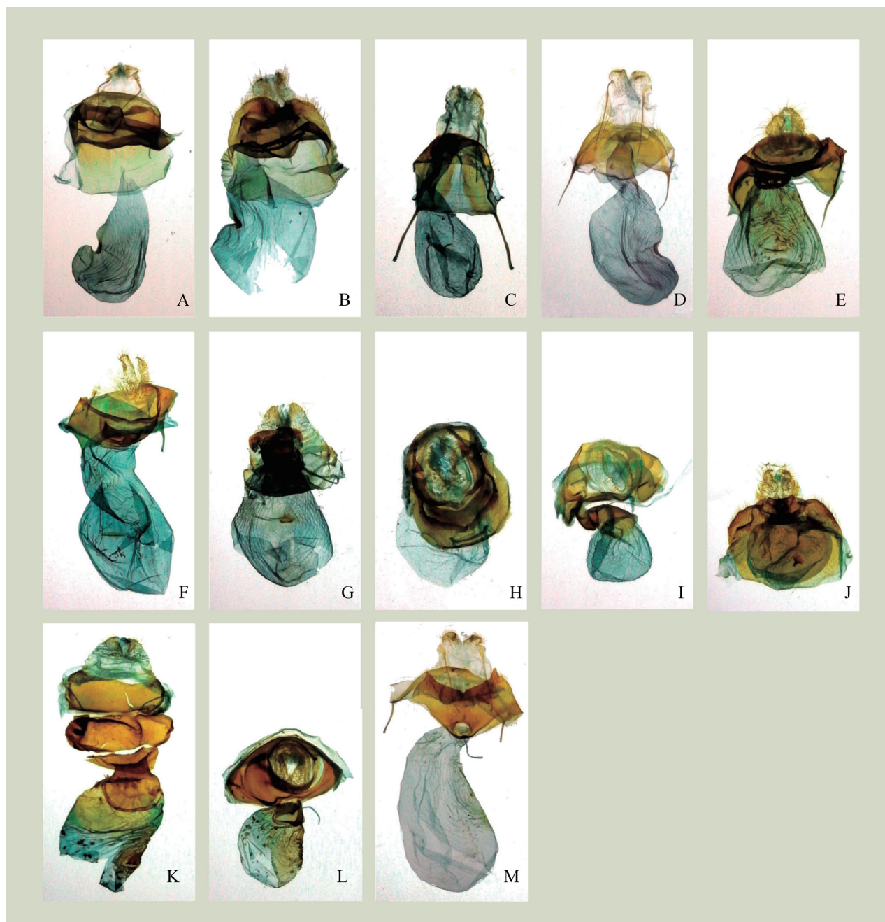
Figure 5 Xylodonta (A-L) and Nycterotis (M), female genitalia, ventral view. 7A. castrena (Brazil); B. ochreibasis , paratype (Brazil); C. imitans , paratype (Brazil); D. guarana (Brazil); E. robusta (Brazil); F. robustoides , paratype (Brazil); G. xylinata (Costa Rica); H. pythia (Mexico); I. scottmilleri (Brazil); J. giffordi , paratype (Brazil); K. mocosa (Ecuador); L. monzoni , paratype (Guatemala); M. russula (Brazil).

series of dark fuscous lunules between veins, before and on termen; cilia fuscous, pale yellow basally. HW semitranslucid whitish, dusted gray towards margins, veins darker. Females FW broader; HW dusted fuscous. Distal margin of 8 th sternite (Fig. 3I) with three expansions covered with long setae towards tip; the lateral ones asymmetrical; central a short digit.