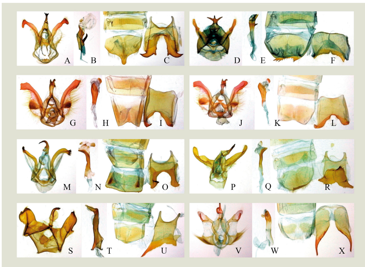
Figure 4 Xylodonta (A-U) and Nycterotis (V-X), male genitalia, aedeagus, 8 th male abdominal segment. A-C. xylinata (Ecuador); D-F. pythia (Mexico); G-I. giffordi , paratype (Peru); J-L. giffordi , paratype (Brazil); M-O. mocosa (Ecuador); P-R. monzoni , holotype (Guatemala); S-U. scottmilleri (Brazil); V-X. russula (Brazil).

interrupted pale yellow on veins; underside pale yellow, slightly dusted fuscous towards costa; postmedial band faded. HW semitranslucent whitish, dusted fuscous towards margins, tornus and dorsum tinged gray. Abdomen dark fuscous dorsally, slightly ringed pale yellow; pale yellow ventrally. Distal margin of 8 th sternite (Fig. 3F) expanded as two large, flat plates, tapered distad to a sharp pointed tip.