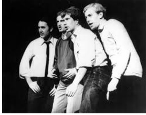
Image 1 – Pictures of the premier of Offending the Audience (1966), directed by Claus Peymann.

Offending the audience (Publikumsbeschimpfung) and Self-accusation (Selbstbezichtigung) are precisely the two plays whereupon Handke tests and puts into practice his first reflections on movement and the filmic phrase. Handke's proposal is to refrain from playing theatrically according to the conventions that guide the relationships between actors, the stage and the audience. His intention, however, becomes paradoxical and highlights the conflicting forces between text and scene. On one hand, there is the sober and vehement disavowal, uttered by the actors, of the elements of drama. On the other hand, the scene is not empty, the stage is not abandoned, there is no breaking of the famous fourth wall. Thus, the dramatic act, in Peter Handke's spoken plays, lies upon a border: both plays disavow the illusion game, but, in the text, they offer nothing more than games among words, phrases (once again) that are logically chained and, in the end, re-