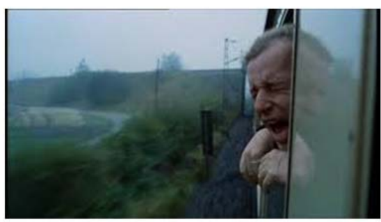
Image 4 – Scenes from The wrong move (1975), by Wim Wenders, written by Peter Handke.

In tandem with a Bildungsroman structure, the script (and the movie) The Wrong Move configures a road movie narrative. This dynamic evokes a singular experience of the modern man, of new makeups that claim other forms of writing, of dramaturgy and aesthetic relationship with the world. However, throughout the script, Wilhelm wonders about the role of writing in the contemporary world, as if, in the movement of his escape, of his shelters and meetings, he would forge the perception and sublimation of his identity crisis.