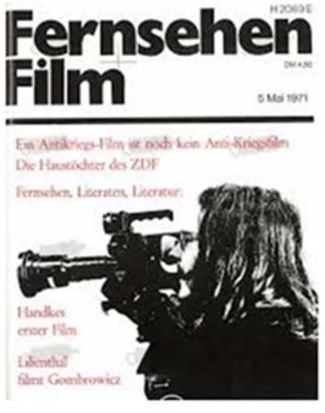
Image 2 – Scene and poster of Chronik der laufenden Ereignisse (1971), by Peter Handke.