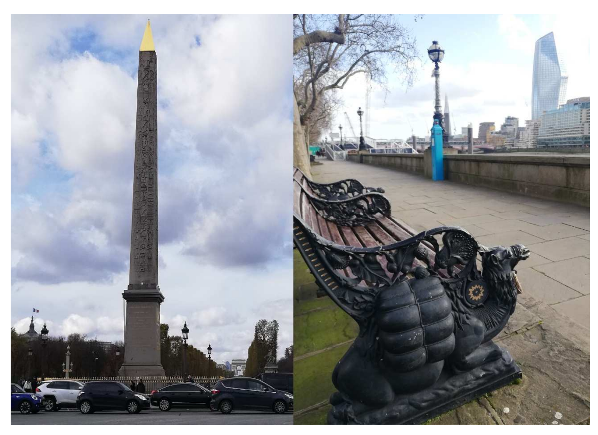
Figure 1 – O n the left, the original obelisk from the Temple of Luxor (southern Egypt) in Paris and, on the right, the banks of the Victoria Embankment in London.