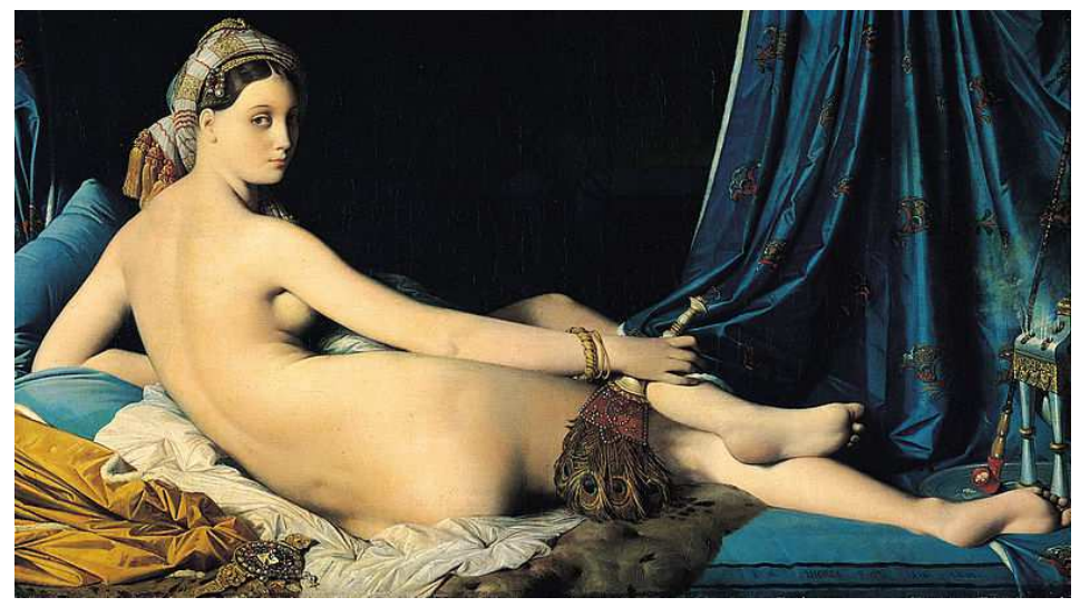
Figure 2 – Great Odalisque (1814) by Jean-Auguste-Dominique Ingres (1780–1867). Collection of the Louvre Museum, Paris, France.

because, in colonial times, the act of covering themselves was already a female habit disseminated by Islamic doctrines. The spaces of coexistence were also generally restricted, inaccessible to men – even the Oriental ones. The painters had to then mobilise their fantasies and desires to imagine and artistically materialise the places they were not allowed to enter. This led to the figure of the odalisque as a character of Orientalist imaginary that embodies the Western expectation regarding the Oriental woman, being a frequent element in the paintings to represent Oriental women as languid, idle and available (Great Odalisque, and Odalisque with slave by Jean Auguste Dominique Ingres, Odalisque by Renoir, Odalisque with tambourine by Henri Tanoux).