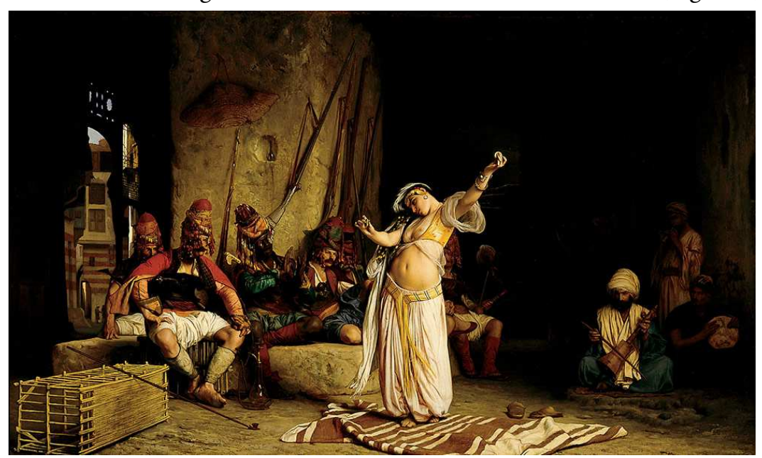
Figure 5 – La danse de l'almée (1863) by Jean-Léon Gérôme (1824–1904).

Even considering that the ghawazee sought to attract the attention of and fascinate the European audience, something that would yield them greater financial return, their representations in pictures, in most cases, exaggerated the erotic aspect of the dance. The female dancers were represented more imaginatively than realistically, especially when the images referred to the internal scenes of the harem or to the awálim . Since we know that foreign men were forbidden from entering the harems and that the awálim from the beginning of the nineteenth century did not perform in front of men, the paintings representing them can be taken as the result of male colonial creation. This is the case of Dance of the Almeh , by French painter Jean-Léon Gérôme, one of the greatest known Orientalists in the visual arts (Figure 5).