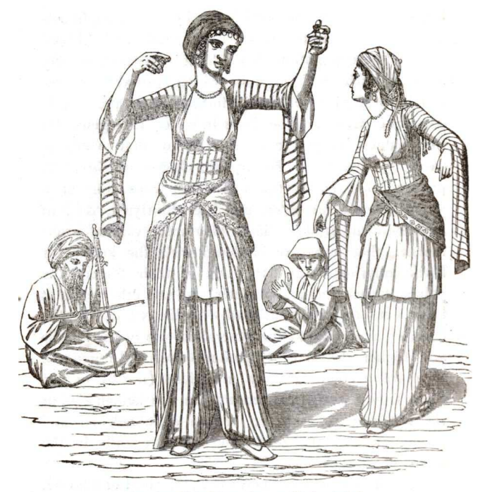
Dancing-Girls (Ghawa'zee, or Gha'zee'yehs).