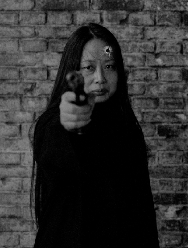
Figure 3 – Xiao Lu. (2003). Fifteen Gunshots...from 1989 to 2003, Detail [Performance]. Beijing.

emotions and conflicts, yet it also becomes a tool to speak out in order to share events and develop critical thinking.