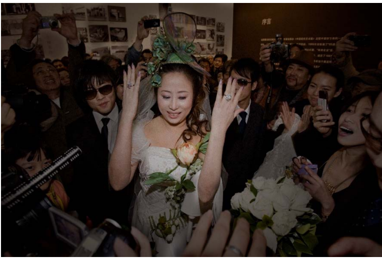
Figure 6 – Xiao Lu. (2009). Wedlock [Performance]. Beijing.

The performance began with a nuptial limousine arriving at the museum to the sound of traditional Chinese funerary music, and four young men carrying a black coffin to the entrance of the museum. Xiao Lu comes out of the coffin wearing a bridal dress and the music changes to a traditional nuptial tune while she enters the art institution. Guo Qiang is in charge of performing the wedding ceremony and the artist, her younger sister, and Gao Minglu participate in the formal speeches. Finally, the performance ends when the bride frees doves after getting married to herself (Figure 6). The wedding becomes a funeral, and the bride does not wait for her consort to conduct the ritual. The officiation of the commitment is saturated with irony, as well as liturgic and para-theatricality. The artist notes: "There is an old saying in China that states that marriage is the tomb of love. Therefore, I used this image of the coffin to emerge out of the tomb and get married to myself. The doves are a symbol of freedom" (Xiao Lu apud Manonelles Moner, 2011).