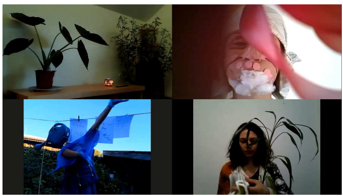
Figure 2 – Print of the collective performances video recorded in the Rituais íntimos partilháveis encounter on July 15 July, 2020.