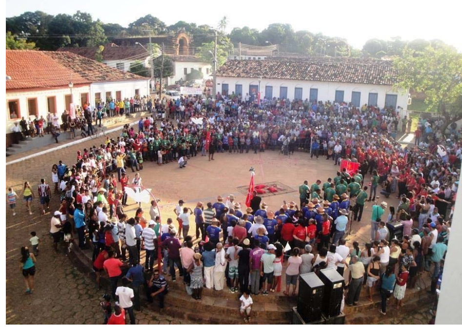
Image 4 - Encounter of the Feasts (Photo by Flávio Cavalera, 2014). Source: Rosa (2015, p. 52).

When the 40-day cycle of the Tour of the Feast is completed along the farms, on Thursday, the Ascension of Christ day, the Encounter of the Feasts happens at the Mother Church Plaza and the party continues in the house of the Emperor. After this date, the Divine Triduum begins: a mass happens at 7 PM in the Our Lady of Nativity Church on Friday, Saturday and Sunday, during which the worshippers sing and praise the Holy Ghost. These moments are preparations for the party that will happen on the following Saturday and Sunday.