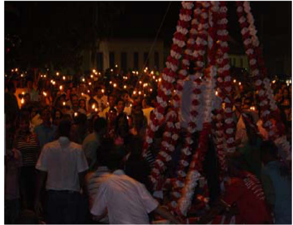
Image 5 – Mast Tour (Auro Giuliano, 2009. Archive Fundação Cultural do Tocantins). Source: Rosa (2015, p. 55).

The Suça opens way to the Mast and next to it go the players of zabumba , country accordion and triangle and the city band, in a hurried procession. In the end of the turn, fireworks are blown off, male and female dancers dance, marking their presence, and walk toward to the foods and liquors that are at their disposal.