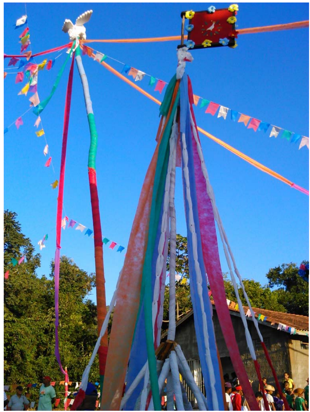
Image 2 - Mast of the Festival of the Divine Holy Ghost (2014).

Easter Sunday marks the beginning of the season of the feasts in Natividade that, for 40 days, will cover by horse the rural region and the neighboring cities. It is three feasts that, gathered in January, choose the