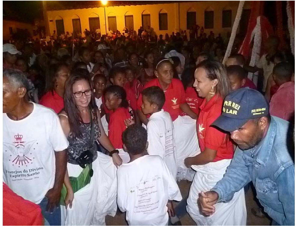
Image 7 - End of the Mast Circle and the Suça circle (2014).

At the end of the Tour, there is the encounter of the Mast with the Suça , next to the Our Lady of Nativity Church. At this moment, the circle is quite tight, due to the amount of people approaching and observing (Image 7). The pulse of the drums covers the collective body, even those people who only watch the Suça are involved by the contagious rhythm, that inscribes in the Feast do Festival of the Divine Holy Ghost of Natividade the marks of a dramaturgy of the ancestry.