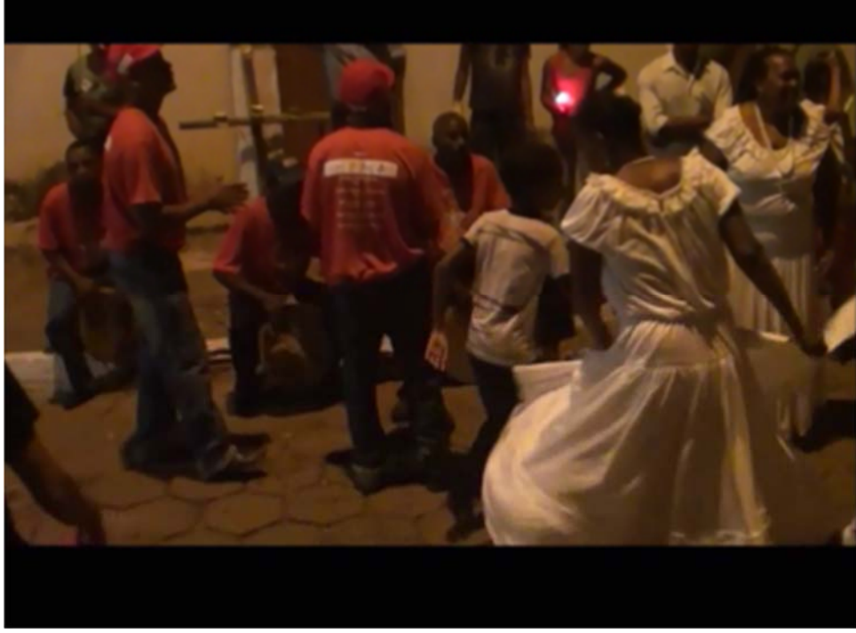
Image 6 - Suça Circle during the Mast Tour (2011).

For a more detailed account of the movement, let us take Dona Altina's example, in the picture above (Image 6). The female Suça dancer holds the skirt and makes movements with the arms, turning around her own axle, and moves with the feet strokes, in which a foot beats on the ground with the metatarsus while the other beats on the ground.