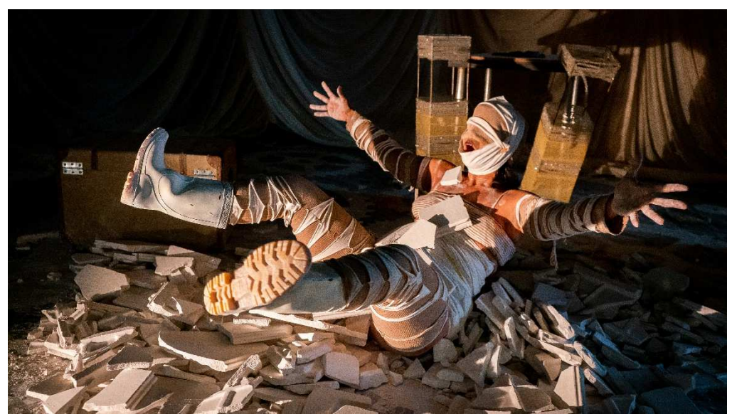
Figure 5: Mummy Fire Survivor.