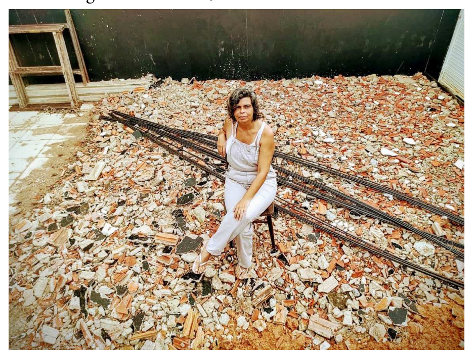
Figure 3: Demolition to build Teatro Xama. April 2021.

is considered. Thus, we experimented with convivial and technovivial practices based on our quarantine experience, such as dramaturgical investigation in an online writer's room, on the Google Meet platform; recording and streaming theatrical improvisations, programs and experiments to the creative team via Google Drive; recording what we call "vagabond attempts" as an experimental initiative about angle dramaturgy; 10 face-to-face performance of the first act of the play in a single session, for the team members and guests only, complying with health measures, at a time of relaxation of distancing rules that included the reopening of local theaters for a short period, from November 2020 to January 2021; launch of the play's soundtrack, available on major digital platforms such as Spotify, Apple Music and Deezer;<sup>11</sup> and reading of the script on the Reading Series: Women Playwrights<sup>12</sup> (Midrash, 2021), streamed live. Also, we came up against the need to build our own theater, pulling down structures that no longer supported themselves—the old terrace at the group's headquarters—to build a possible space for the theatrical meeting. To this end we created a physical/structural design: Teatro Xama, for a reduced audience.