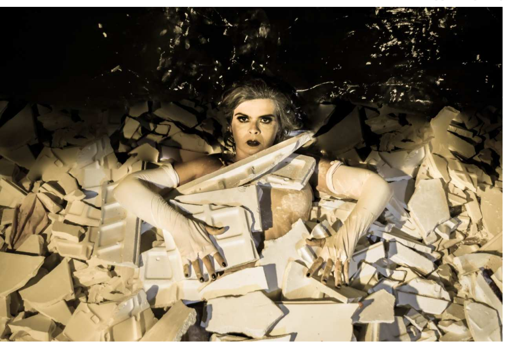
Figure 4: Experiment with plaster.