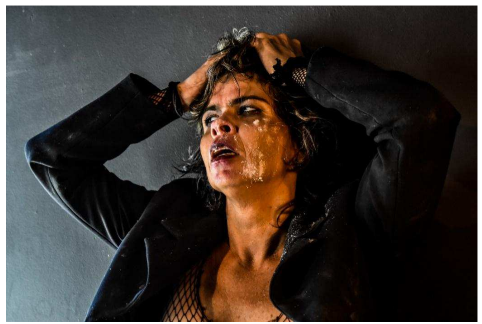
Figure 7: The Star's Decadence scene.

The experience of vulnerability breaks with "the straitjacket of the planned." In The Vagabond , risk and ex-position introduced creative conditions for staging and acting founded on the principles of vulnerability (Jubb, 2011). In the process of staging the play, we created a permanent environment of instability with plaster debris that unbalances the actress, in a destroyed space that becomes knowable as the performer breaks down – while the character tries to rebuild the space, the inhospitable of the rubble competes for the deterioration of the figure – in an eternal movement of falling and getting up, of building and collapsing. In our practice, we considered that the actress's greatest difficulty, even among so many constraints on mobility, was dealing with the risk of exposing herself, of having her layers investigated.