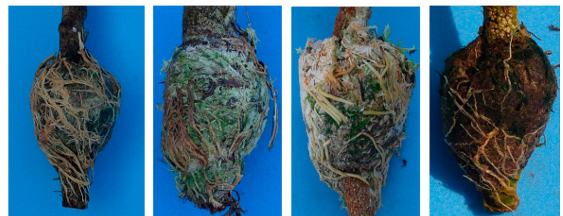
FIGURE 1- Appearance of rambutan layering roots in spring (a), summer (b), autumn (c) and winter (d). Jaboticabal, 2012.