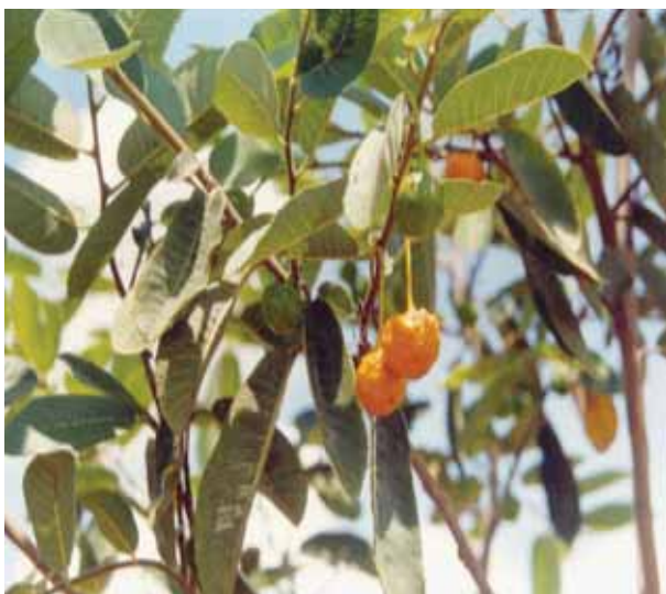
Figure 2.1. Macroscopic aspect of the fruit and leaves of Brosimum gaudichaudii Trécul. (mamacadela).

Oral administration of BG root exsudate induced animals to death, proportionally to the administered doses (Table 1). The approximate lethal po dose was 3750 mg/kg, and through the ip via, 2900 mg/kg. Logarithms and probits were determined for each dose, aiming at calculating the median lethal dose (DL50), which has resulted in 3517.54 mg/kg ( po ;