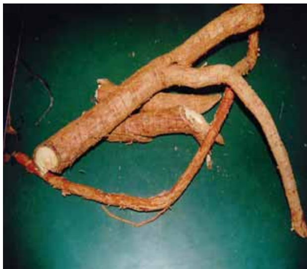
Figure 2.2. Macroscopic aspect of the roots of Brosimum gaudichaudii Trécul. (mamacadela).