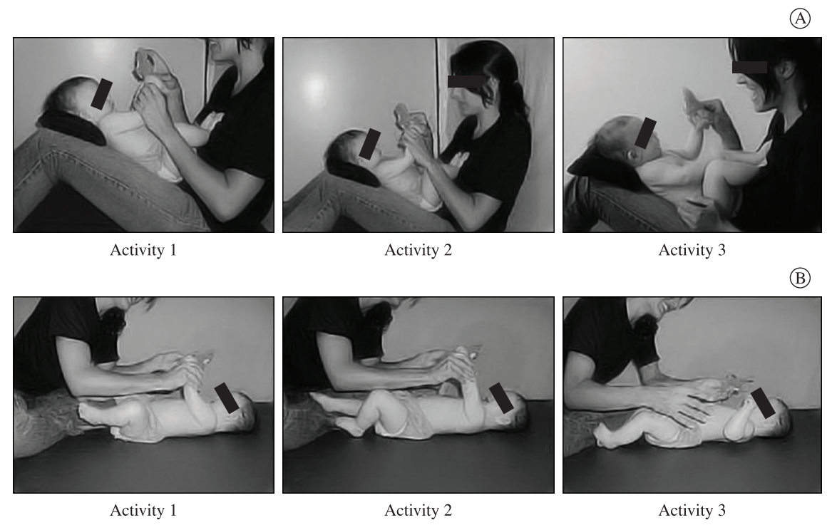
Figure 2. Training in the reclined position (A) and training in the supine position (B): activity 1; activity 2; activity 3.