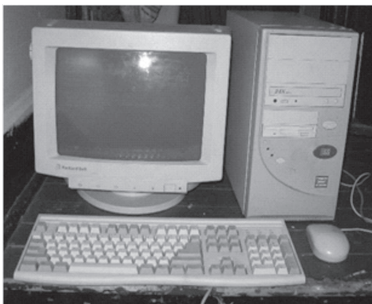
Figure 3. Equipment presenting problems

In addition, according to the interviewees and what was observed, due to the lack of a financial budget it is not possible to acquire new supplies such as toner for printers, replacement pieces for computers, and software licenses. In one of the universities studied, a single computer is shared by up to four supervisors.