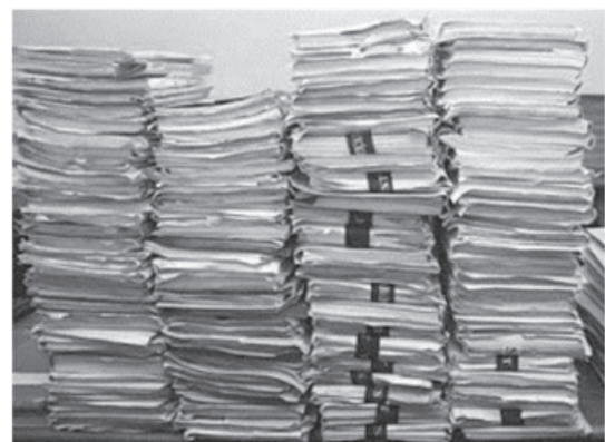
Figure 2. Work table during the routine of a contract supervisor

computers and printers are constantly presenting problems” (INTERVIEWEE 4). Figure 3 illustrates the situation of a specific work station of a contract supervisor.