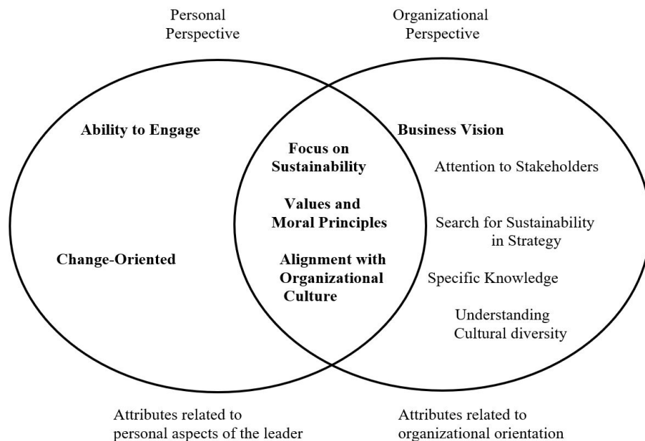
Figure 1. Attributes of Sustainable Leadership in Perspectives