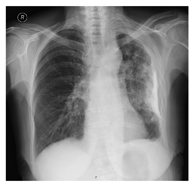
Fig. 3 Radiological findings in the thorax.

Standard tuberculostatic therapy was started and, one month after the treatment, improvement of the symptomatology initially presented was observed ( Fig. 4 ).