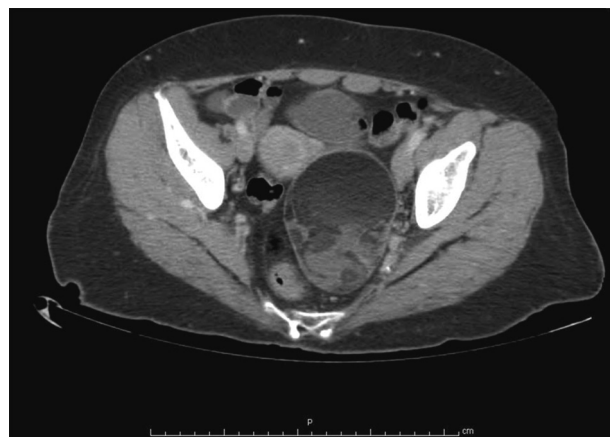
Fig. 2 CT scan image — Left adnexal mass with 102 \times 77 mm with heterogeneous content and abundant fat component.

(Ca15.3-9.2 UI/mL; \alpha -fetoprotein - 0.76 ng/mL; \beta human chorionic gonadotropin - < 1.2 mUI/mL; and Ca125-14.1 UI/mL), except for Ca19-9, which was markedly raised (8922.76 UI/mL). Upper gastrointestinal endoscopy and total colonoscopy did not show signs of gastrointestinal malignancy.